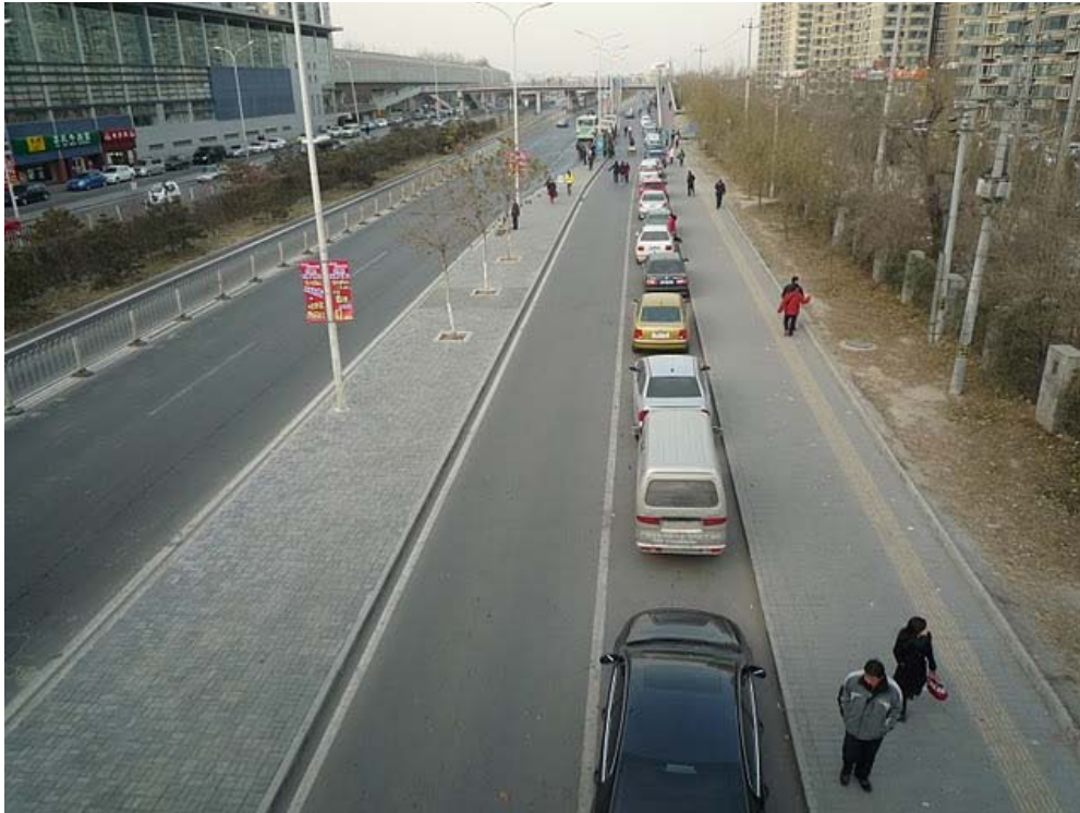
Figure 19: Black cabs lined up outside Tiantongyuan station