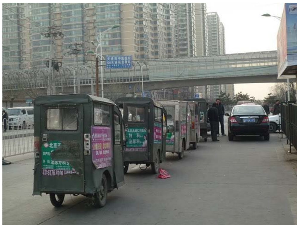
Figure 20: Illegal pedicabs lined up outside Tiantongyuan station