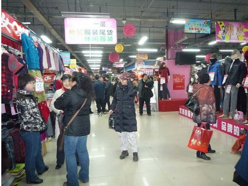
Figure 13: Inside Tian Tong Wei Huo

The construction of Tian Tong Wei Huo constitutes informal land management and planning. Its construction was able to occur due to a lack of government regulation stemming from the pre-economic reform era and was motivated by a profit-driven developer.