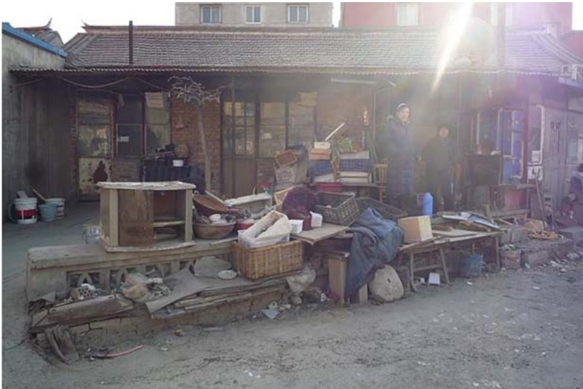
Figure 5: Pre-reform era housing in Yandan Village