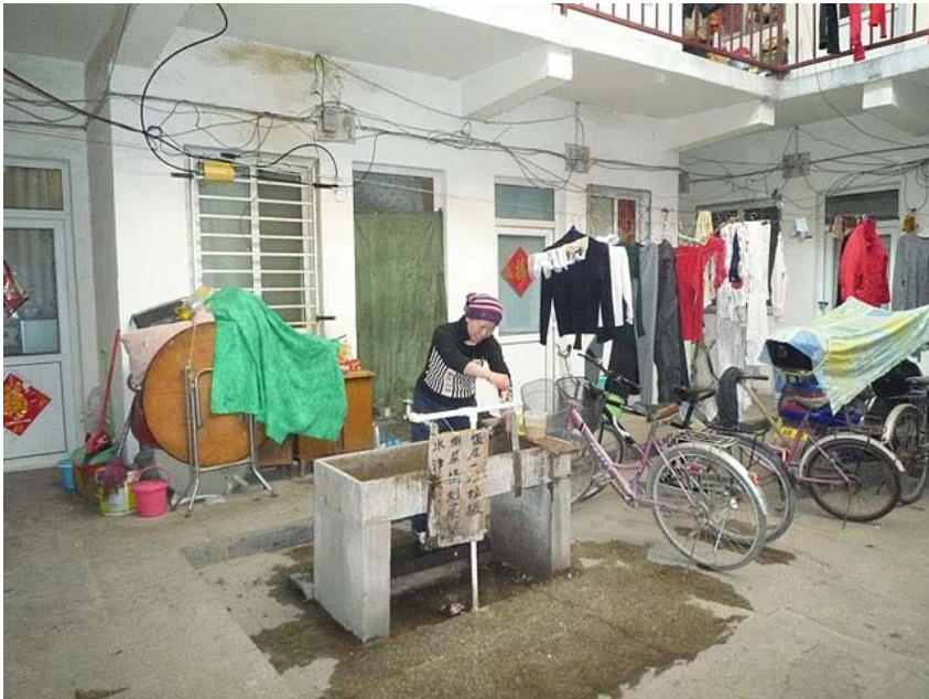
Figure 7: Clean water pump in Dagong Village