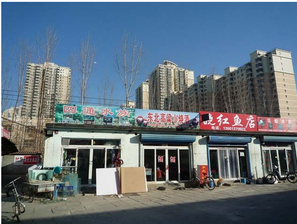
Figure 18: More stores in Taiping Village