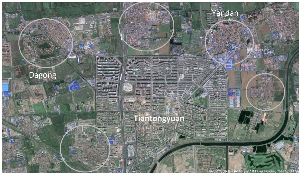
Figure 1: Urban Villages in Tiantongyuan