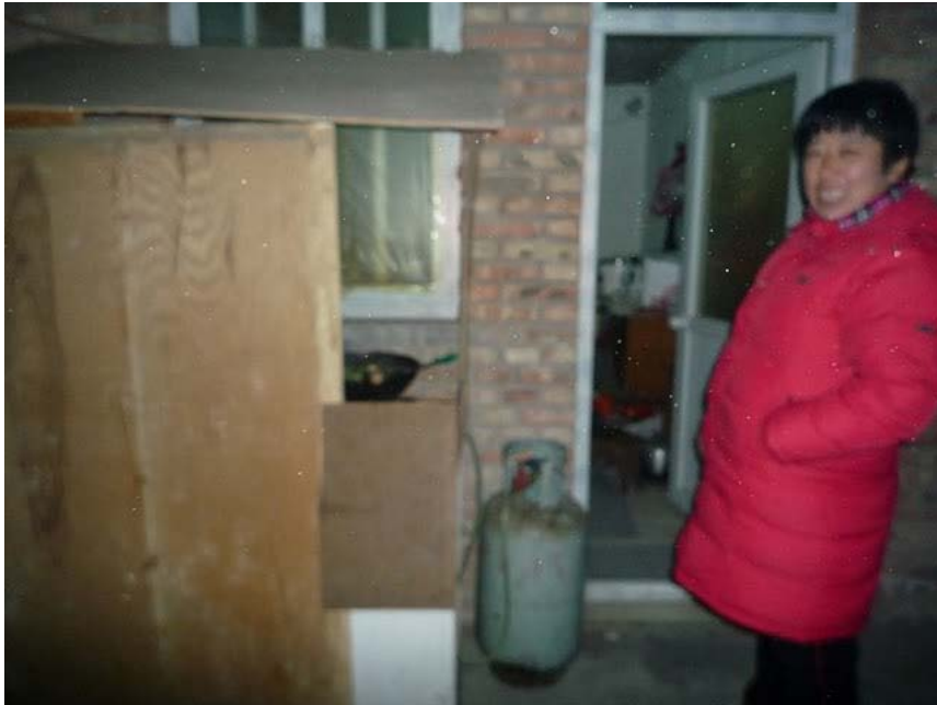
Figure 9: Informal kitchen in Dagong Village

also felt street vendors contribute positively as well. They provide inexpensive food and goods in a place with few shopping options. Many food items cost only few yuan ($0.30- $2.00). Also, they bring convenience for Tiantongyuan residents that lack time to prepare meals, and convenience to migrant workers living in urban villages where few apartments have kitchens (See Figure 9).