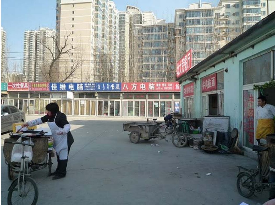
Figure 16: Street vendor in Taiping Village