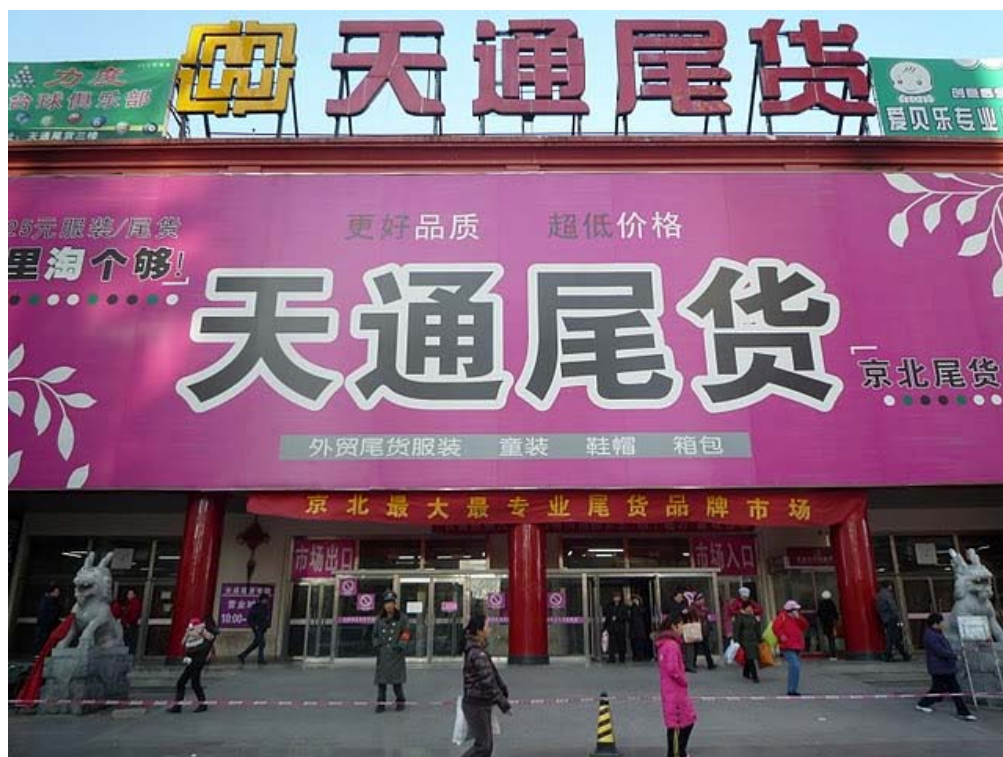
Figure 12: Tian Tong Wei Huo

The land use map for Tiantongyuan does not designate the land use for Tian Tong Wei Huo as commercial. At the time of Tiantongyuan's development, Chinese urban planning under the City Planning Act dictated that cities create master plans. However, Huo constitutes an unregulated land use change from residential to commercial. It is a large, multi-storey clothing market that attracts shoppers from outside Tiantongyuan. The market operates by renting out stalls to individuals. The majority of these clothing sellers are migrants. (See Figure 13).