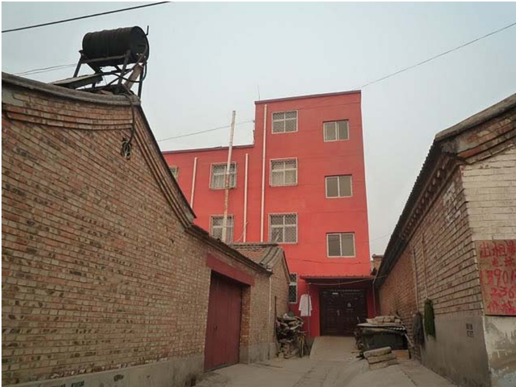
Figure 3: Pre and post-reform era buildings in Dagong Village