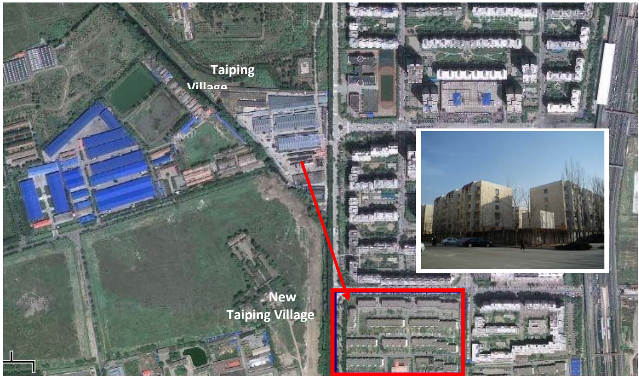
Figure 14: Taiping Village

Due to the informality of the land exchange, new structures in the Taiping market have been constructed simply and cheaply so that removal is easy and not costly in the event that the government designates the property for demolition. Due to the village's location in the middle a main road less than a quarter mile from the Tiantongyuan subway station, future government-mandated demolition is considered highly probable. Furthermore, even though the developer is the land occupier, the village collective still holds the land ownership certificate. Therefore is no economic incentive as there is in the urban villages to develop the property in order to gain greater government compensation in the event of demolition. This lack of compensation incentive also explains why the absence of any new residential buildings which are prevalent throughout Tiantongyuan's urban villages where the compensation incentive does exist. Instead, the market's shopkeepers live in the original villager housing which is old and dilapidated.