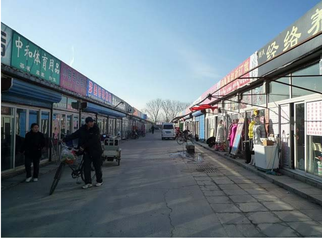
Figure 15: Stores in Taiping Village