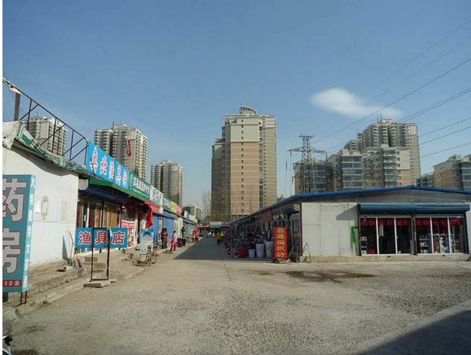
Figure 17: Taiping Village and Tiantongyuan