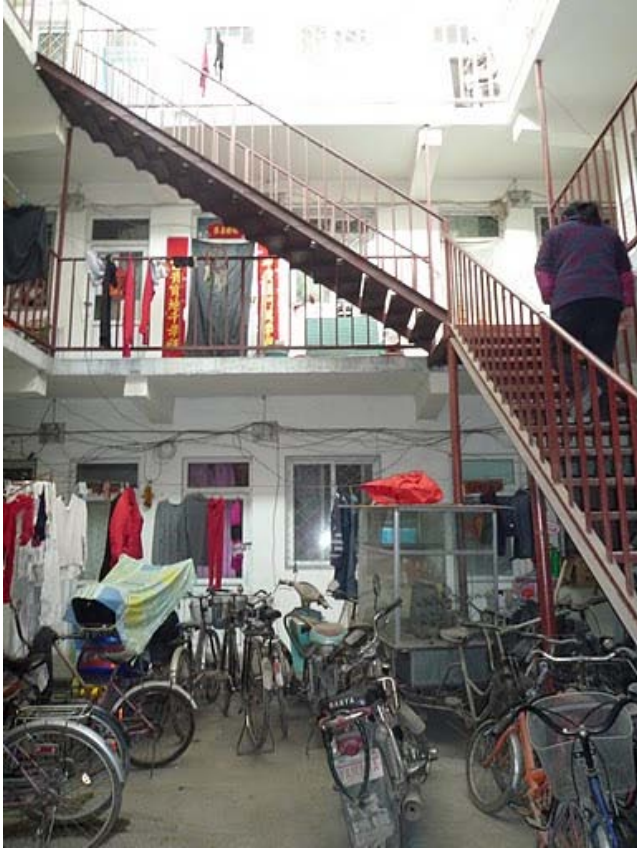
Figure 6: Interior of newly constructed apartment in Dagong Village