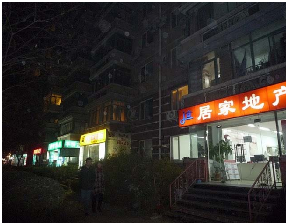
Figure 11: Unregulated change in land use designation