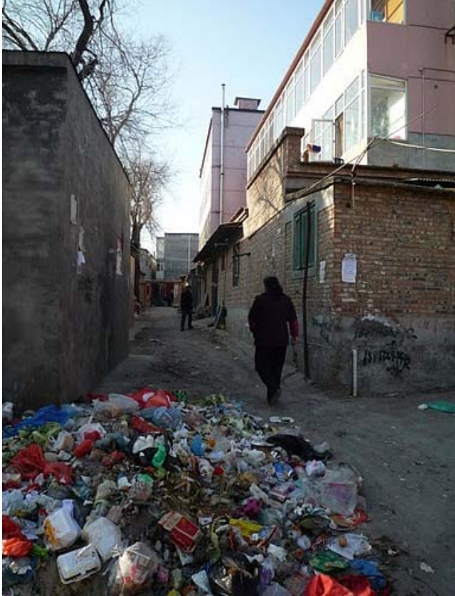
Figure 4: Trash accumulated in Yandan Village