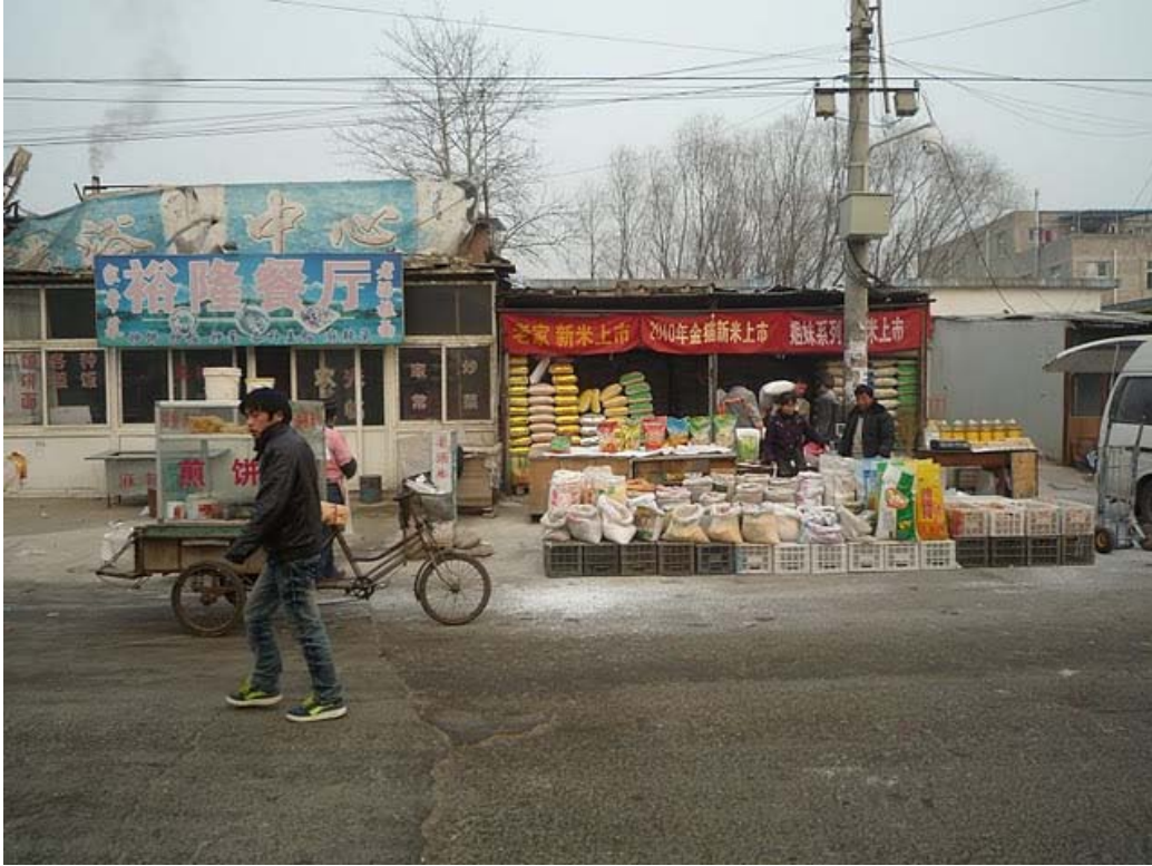
Figure 2: Streets of Dagong Village