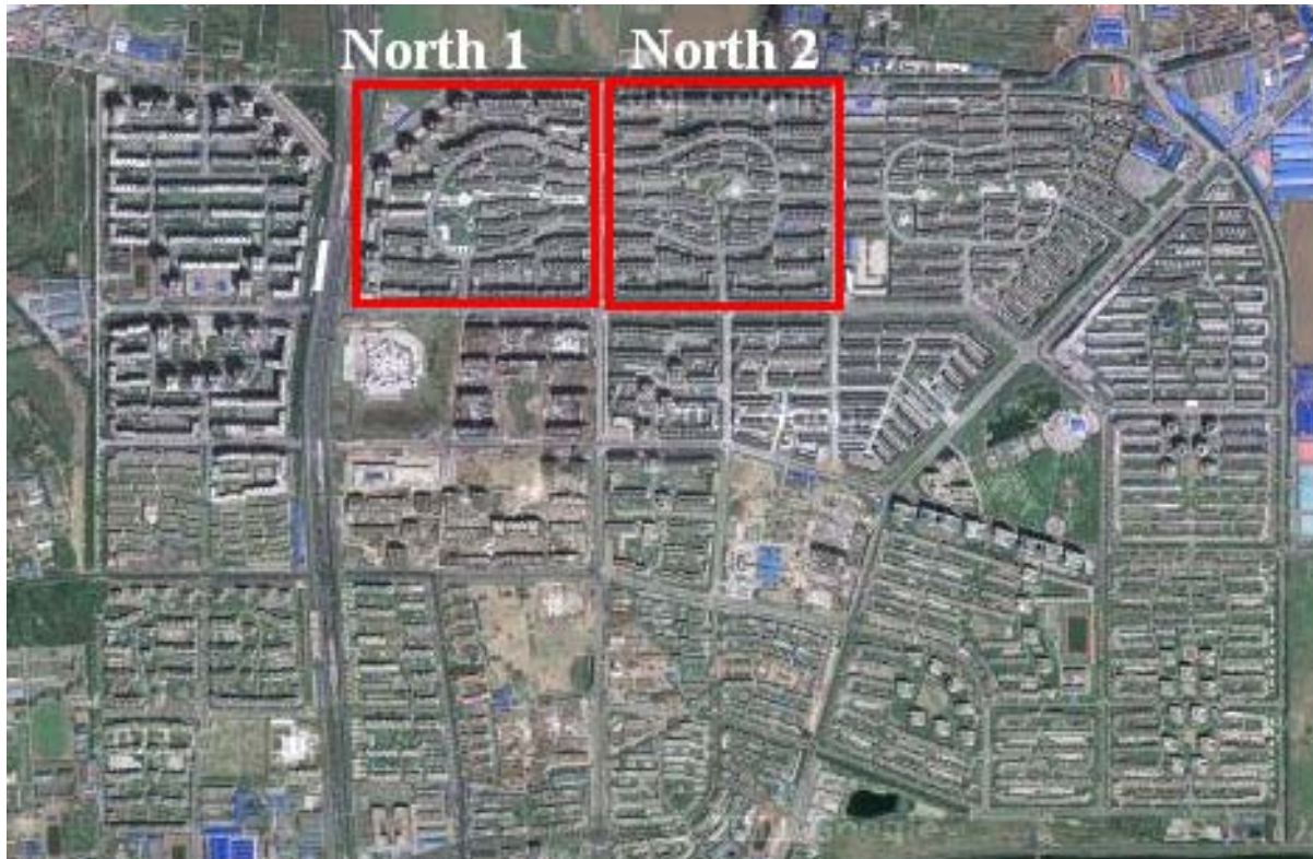
Figure 8: Location of illegal subdivisions in Tiantongyaun

While most of the literature on affordable housing for migrants focuses on the urban villages, there is an additional source of affordable housing for migrant workers in Tiantongyuan. Formal housing is being illegally subdivided and rented out individually to multiple migrant workers to a single apartment. Areas North 1 and North 2 of Tiantongyuan in particular are noted for this type of activity. (See Figure 8).