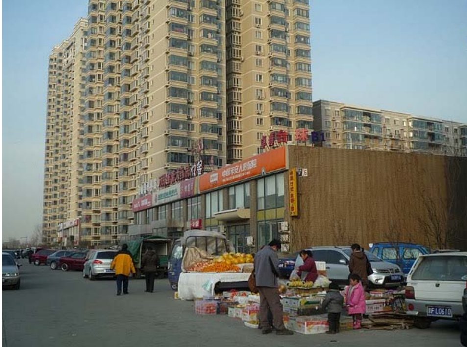
Figure 10: Informal street vendor in private space